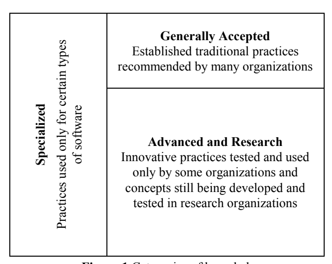
Figure 1 Categories of knowledge

Knowledge Area Specialists are also expected to be somewhat forward looking in their interpretation by taking into consideration not only what is "generally accepted" today and but what they expect will be "generally accepted" in a 3 to 5 years timeframe.