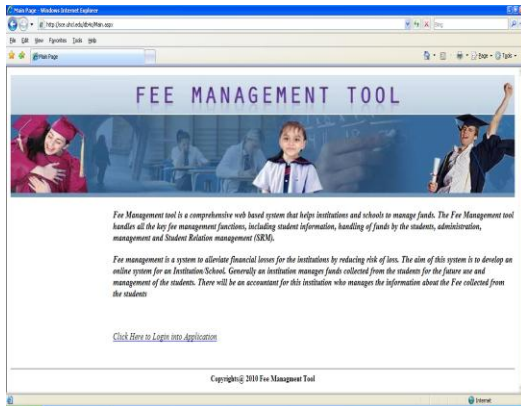
Figure 1: Home page of the System