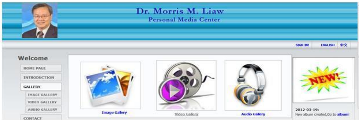
Figure 2(b) - Gallery page for the application.