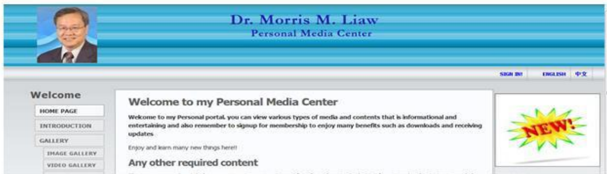
Figure 2(a) - Home page for the application.

The following figures show screenshots of pages on the Personal Media Center application website. Figure 2(a) shows the home page of the application, and Figure 2(b) shows the gallery page of the website which serves as the root page for browsing all media.